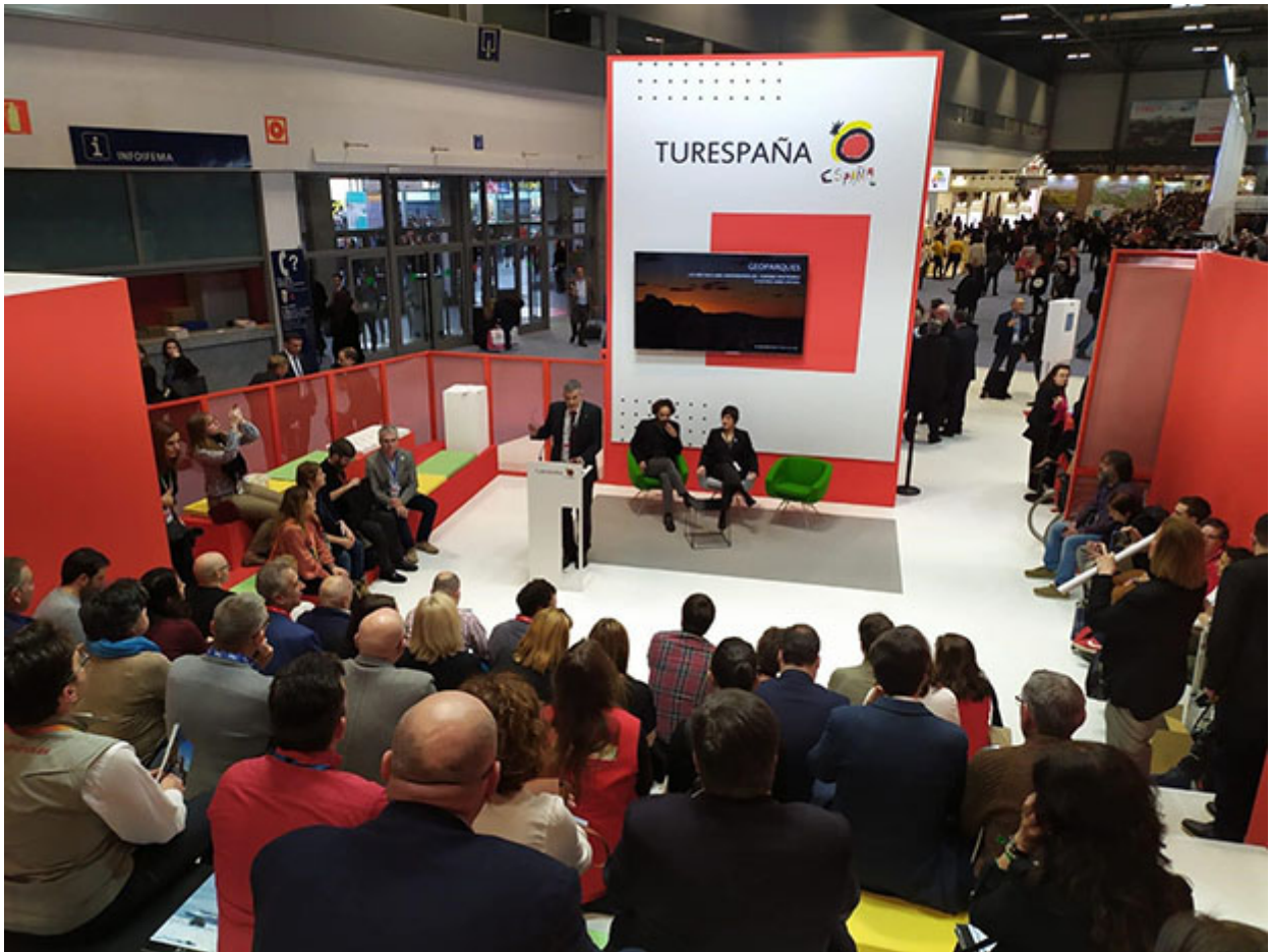
Geopark presentation event in TourEspaña pavilion at FITUR 2020