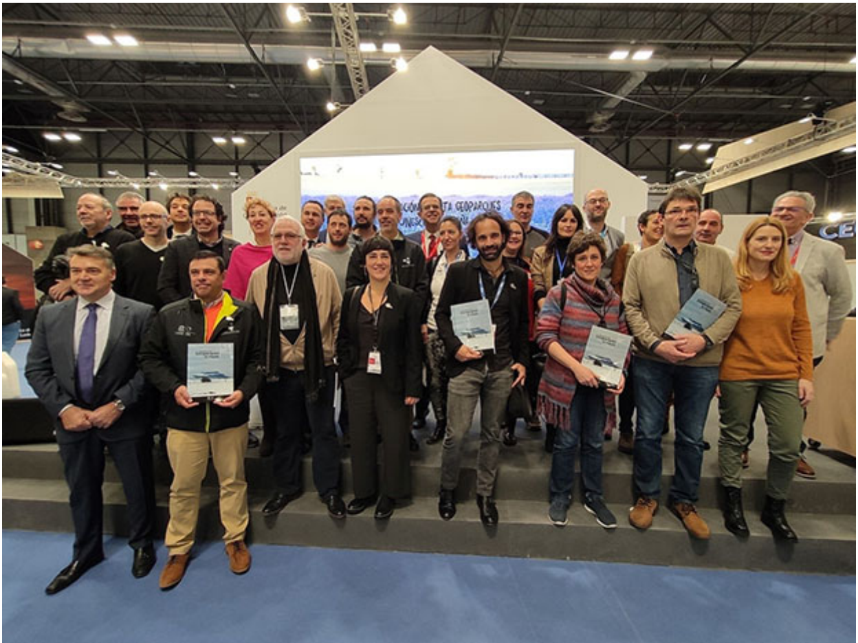
The Spanish Geoparks representatives in a group photo at the presentation event