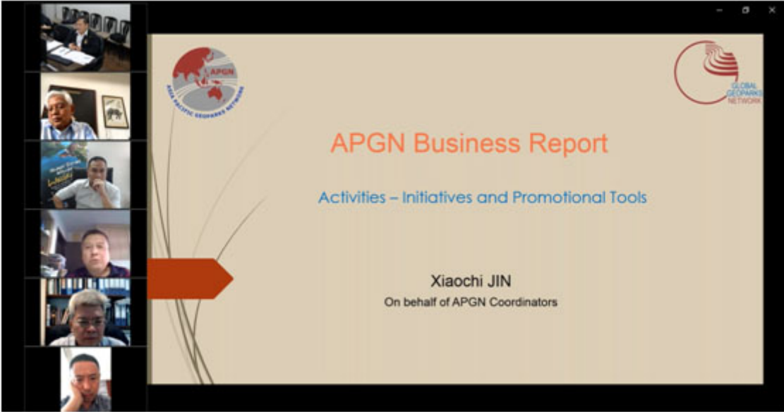
APGN AC meeting