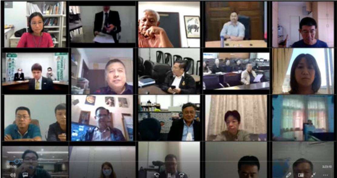
APGN CC meeting